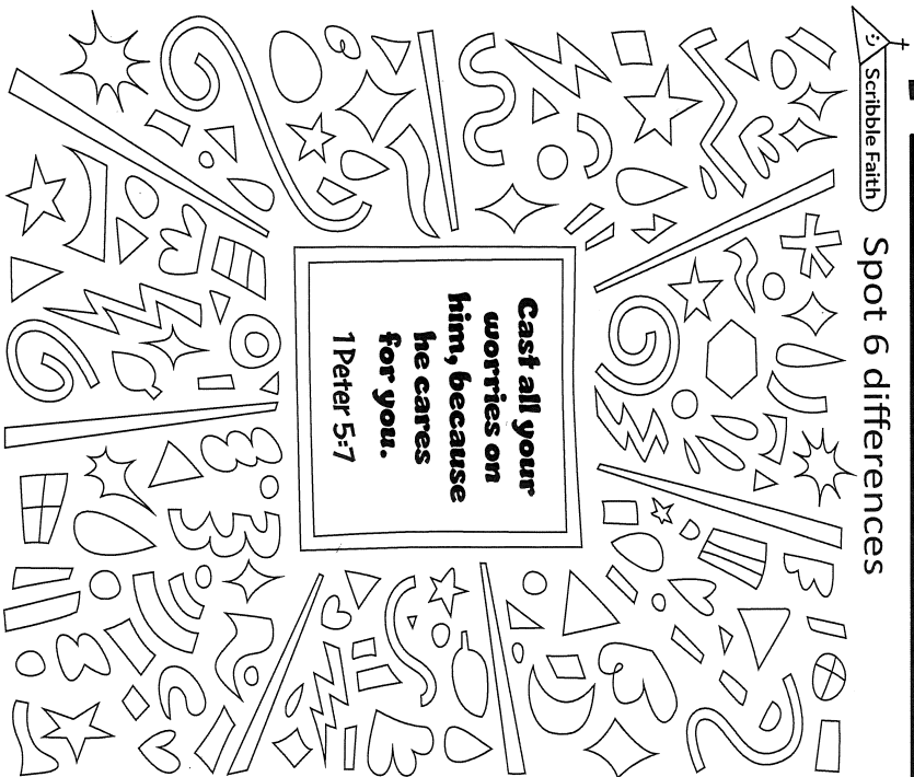
Spot 6 differences